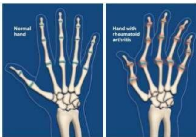
Figure 1: The figure presents a one type from arthritis ject, Arthritis, Orthopedist.

Arthritis is a term often used to mean any disorder that affects joints. Symptoms generally include joint pain and stiffness. Other symptoms may include redness, warmth, swelling, and decreased range of motion of the affected joints. In some types other organs are also affected. Onset can be gradual or sudden.