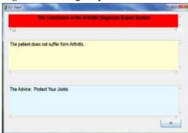
Figure 4: The figure shows diagnosis and recommendation of the expert system