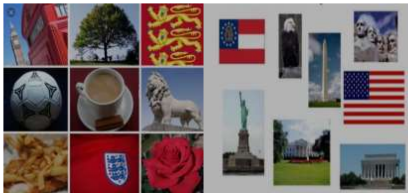
Picture 3. The symbols of Great Britain and USA.

The use of the symbols of the British and American symbols on the teaching of state symbols for 2nd year students ("Country Study" electronic text, "Symbols" assignment Picture 3):