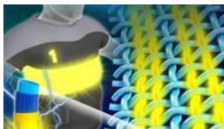
Figure 2 - HEI yarn

The incredible ideas and fantasies of designers are becoming a reality. The use of 3D printing to make models of clothing, shoes and accessories is a qualitative leap in the development of fashion. The material that is used for printing is hardened powdered nylon. The first 3D dress was designed by designers Francis Bitonti and Michael Schmidt. The dress was assembled from 17 separately printed fragments. The famous model Dita von Tiz presented to the public a 3D - an outfit. Experts noted the high density and insufficient flexibility of nylon, and now a lighter and more elastic material - elastomer Elasto Plastic is being developed. However, the creation of 3D models of shoes from nylon continues successfully.