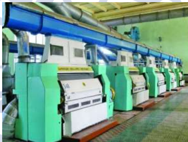
Figure 1. 5LP linter equipment

The process of separating cotton wool, i.e. lint, from the seed is called linting. This is called a linter when done on hardware. Linters also have a seed chamber delimited by an apron, a seed comb, a colossal grid, and a pestle brush. Linting of seeds is carried out in this chamber. An air flow system equipped with devices to separate the lint from the saw teeth [1-5].