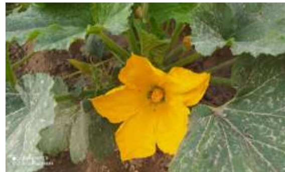
1-rasm. Patisson guli.

Ekish muddati: Janubiy viloyatlarda 1-20 aprelda, markaziy viloyatlarda 20-30 aprelda, shimoliy viloyatlarda 1-15-maygacha ekish mumkin.