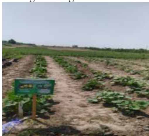
3-rasm. Tadqiqot maydonchasi.

Oq-13. O'rta pishar nav. Tup hosil qilib o'sadi. Unib chiqqandan to meva tukkuncha bo'lgan davr 55-67 kunni tashkil etadi. Mevasi disksimon. Chetlari sezilar sezilmas bo'laklarga bo'lingan. Bu 2 nav davlat reestriga kiritilgan.