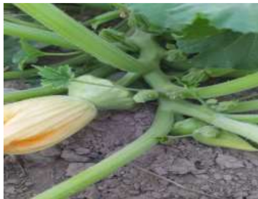
2-rasm. Patissonning 2-3 kunlik mevasi.

Oq-13. O'rta pishar nav. Tup hosil qilib o'sadi. Unib chiqqandan to meva tukkuncha bo'lgan davr 55-67 kunni tashkil etadi. Mevasi disksimon. Chetlari sezilar sezilmas bo'laklarga bo'lingan. Bu 2 nav davlat reestriga kiritilgan.