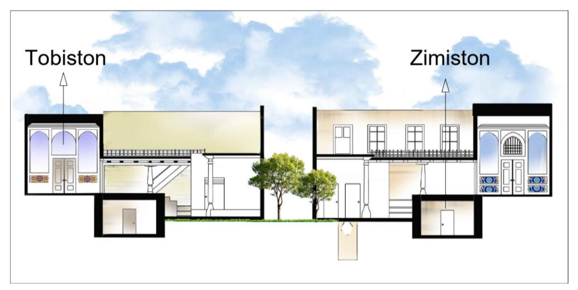
Fig 4. Example of Bukhara dwellings with the "Tobiston" and "Zimiston" parts. Example from researcher.

To sum up, traditional dwellings in Uzbekistan have their own territorial features, and the Khorezm grand porch has adapted to the hot region by creating a microclimate in the courtyard, acting as a wind trap. Traditional residences of Bukhara have summer rooms with high ceilings and cooling holes from the basement. South walls are usually double-layered, this method is called "double chinch" and aims to reduce the solar radiation on the south walls and prevent the internal walls from overheating. The winter rooms and the winter rooms are small and the ceilings are not too big, so heating the rooms is easy. All such traditional approaches indicate that the residential architecture is adapted to the climate and that there are elements of stability.