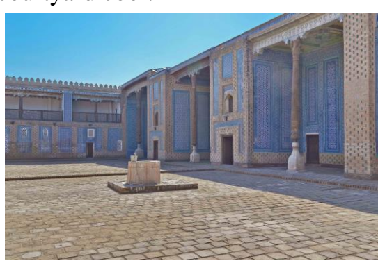
Fig 1. "Ters" and "O'ng" ayvans of the "Taskhovli".

In this case, the porch built on the north side is higher than the porch built on the opposite side. This process provides cool air in the courtyard during the hot summer heat.