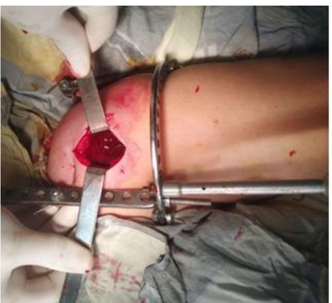
Figure 1b. – distraction to the fractured area using an external distraction apparatus to the shoulder joint c. – anterior posterior projection x-ray of the shoulder

Surgery: The patient lying on his back, under general intravenous anesthesia and X-ray television monitoring a multi-fragment fracture of the proximal portion of the humerus was confirmed. The shoulder was moved 30–35 ° away from the body, and in the external rotation position, one proximal spit of the distractor was passed through the acromion. The distal part of the humerus was held at the intersection of 2 Ilizarov wires on the ridges and fixed to the distal ring of the distractor. Distraction was given to the external apparatus. The position of the bone fragments is relatively satisfactory when viewed on an X-ray television device (Figures 1b, c).