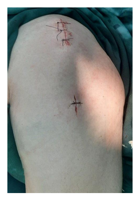
Figure 1g. The operation wound sutured.

The external distractor apparatus was dismantled after we were satisfied that the placement of bone fragments in the X-ray television device was satisfactory. The operation wound was sutured layer by layer. The duration of the surgical procedure was 45 minutes (Fig. 1g).